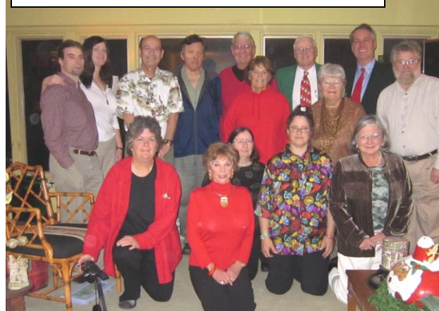
December Shell Club Christmas Party Attendees

Want to know your due date? Look at your S-O-G address tag and if the date has passed or is close to today's date -Your Dues are Due