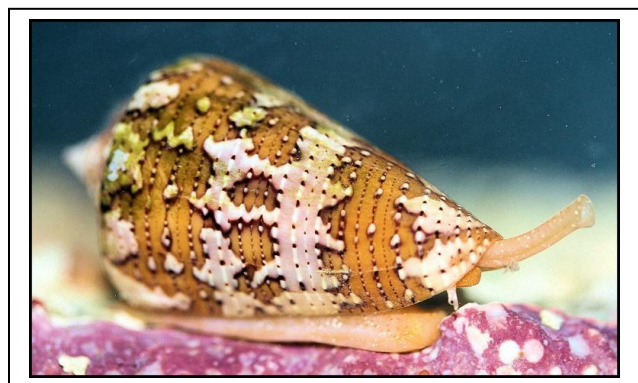
Conus cedonulli dominicanus Hwass, 1792, Union Island, 2010]