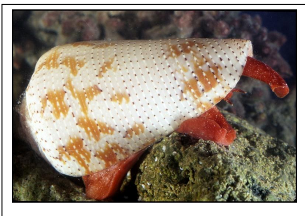
Conus cedonulli dominicanus Hwass, 1792 Tobago Cays, in 2000]