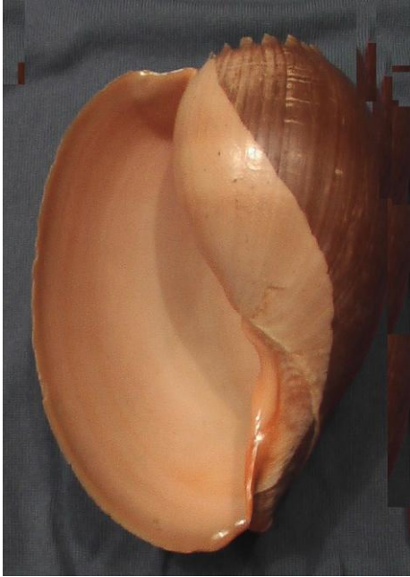
Melo aethiopica Linnaeus, 1758