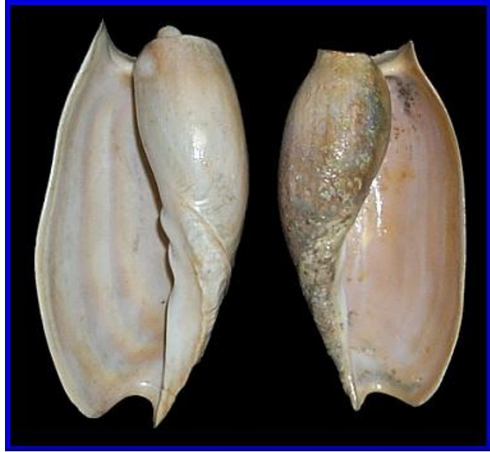
Cymbium cucumis Roding, 1758